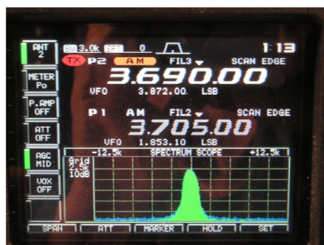
Figure #1 shows what a CW signal looks like. There is no side band information so the width of a single signal is narrow.