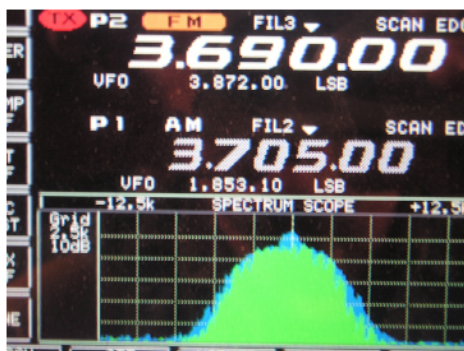
Figure #3 shows a narrow band FM signal (in this case total width is less than 12 KHZ ).