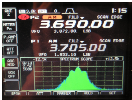
Figure #2 shows an AM signal (mixing upper and lower sideband information with the carrier). In this case the total width of the envelope is less than 6KHZ.