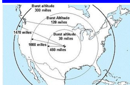
EMP AREA BY BURSTS AT 30, 120 and 300 MILES Gary Smith, "Electromagnetic Pulse Threats", testimony to House National Security Committee on July 16, 1997

As unlikely as an EMP may seem, these topics keep popping up in the media, can be heard on CSPAN, found on the Web, and have actually been mentioned in one of the recent Presidential debates. If you don't already know, an "Electromagnetic Pulse" (EMP), has been declared one of the most likely threats that may one day be used against the United States. NASA has it's own spin on a similar threat, however theirs is from the sun in the form of a Coronal Mass Ejection, or Solar Flare, similar to the 1859 solar storm that burned telegraph wires across Europe and the United States. Both bring on the potential for a TEOT-WAWKI, or otherwise known as "The End of The World as We Know It" event. Imagine life with limited or no satellites, phones, power grid, internet, radio, tv, and probably a few other 21st century comforts.