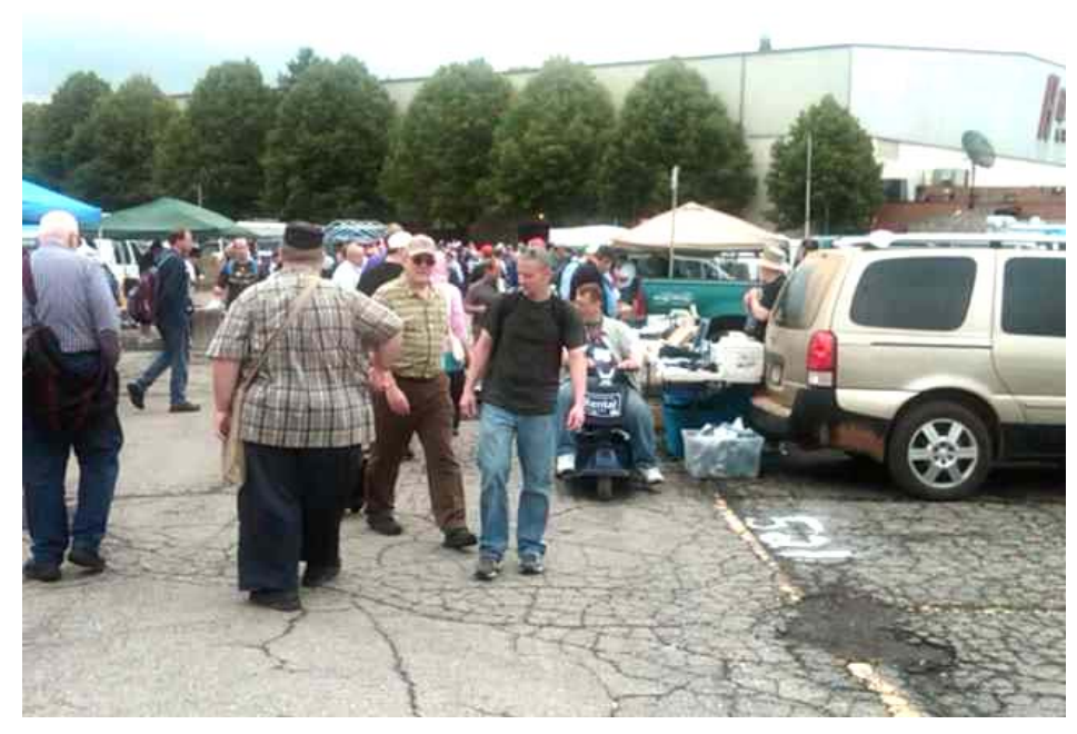
Hams from all over the U.S. and many foreign countries converge on Dayton Ohio every May to see what's happening in Ham Radio. The guys in the above photo (There are some YLs and XYLs at Dayton!)