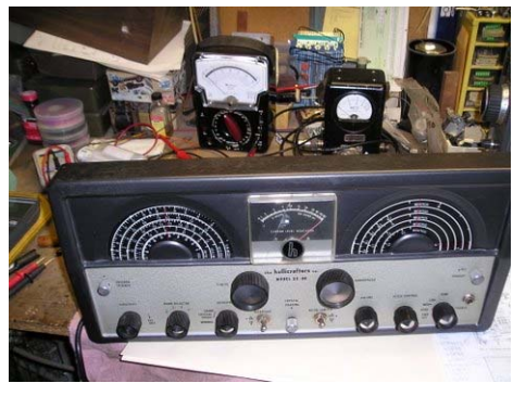
Carl is re-building a vintage SX-99 Hallicrafter's Receiver