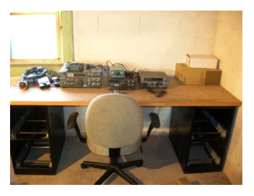
WA2FTI's new Shack. No antenna, nothing's hooked up yet... at least it's on the ground floor!