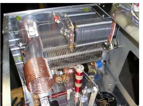
Here are couple of WA2UJX's Homebrew Projects:

Homebrew 4X1 Transmitter. It's not ready to make RF yet... But SOON!