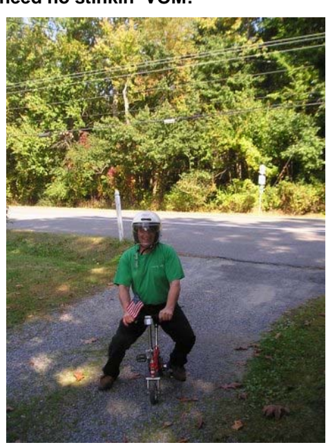
WA2UJX's new mobile?