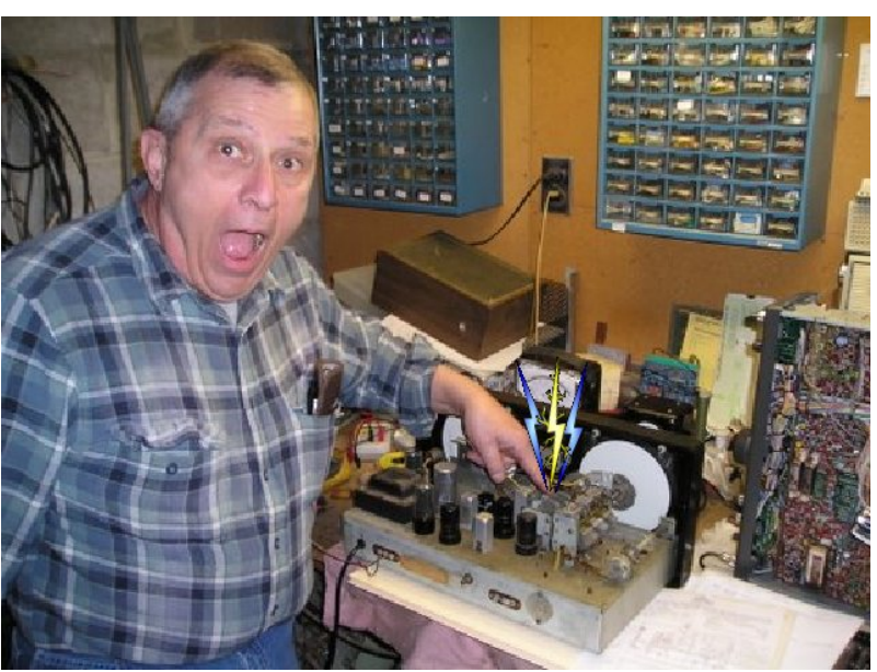
Carl don't need no stinkin' VOM!

Power Sense Board to use with the 4X1 Transmitter. KC2FXE helped etch the Circuit Board