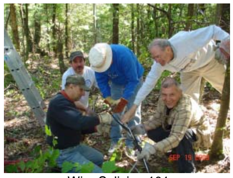
Wire Splicing 101