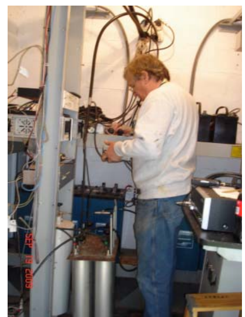
Hmmmm! Seems to be a cable left over!