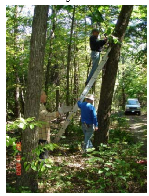
Getting the wires back up