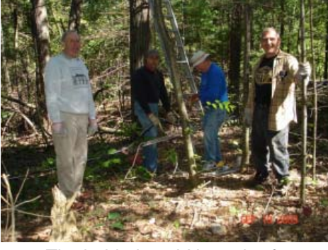
The ladder's up! Now what?