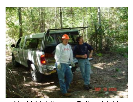
You'd think it was a Railroad Job!