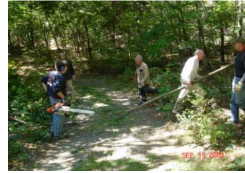
Clearing the Access Road

September 19, 2009