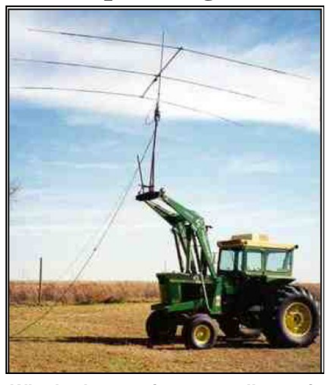
Why bother putting up a tall mast? Just borrow a fork-lift or front-end loader for Field Day weekend!