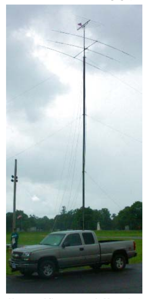
Neat mobile antenna! Must be hard driving under trees and bridges! Barry, WA2KLP, snapped this shot of the Ripper's beam and tower (on the far side of the truck!) at this year's Field Day.